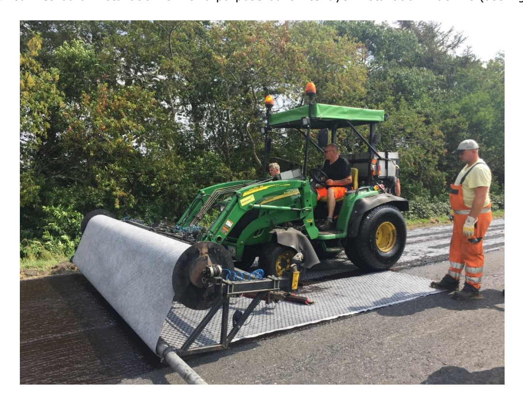
Figure 4: Mechanical Installation

The preferred method of installation is with a purpose-built interlayer installation machine (see Figure 4).