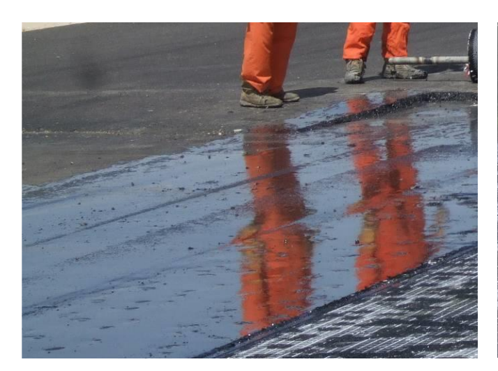
Figure 2: Mirror effect of fresh bond coat

• For overlaps, where allowed, spray bond coat on top of the previously installed layer, slightly wider than the overlap width; avoid oversaturation.