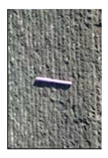
Figure 1: Finely milled substrate