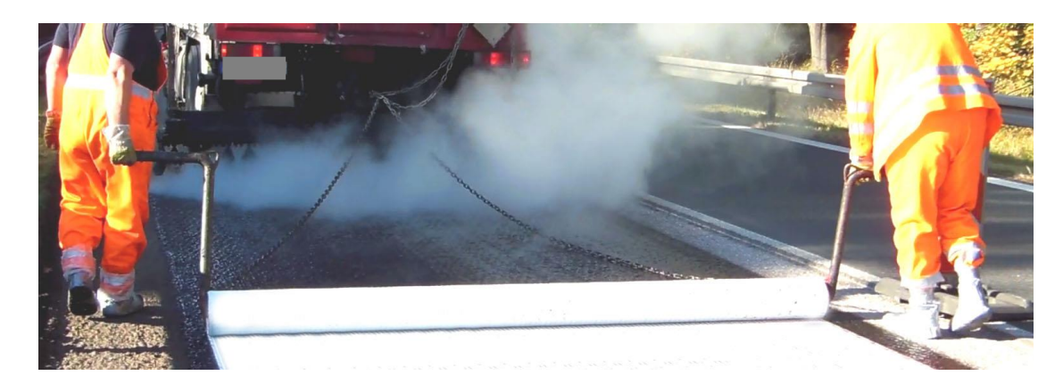
Figure 5: Manual installation with chains and 'Z' bars

For longer lengths the manual process can be aided by connecting the roll to the bond coat spray truck using chains connected to a steel bar passed through the roll core (see Figure 5) with 'Z' shaped handles to control orientation.