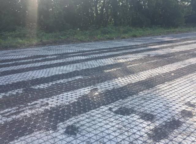
Figure 3: Black prints in the fabric after installations